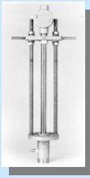
*NPT/High Pressure Adjustable

*(Also available with flanged process connection).