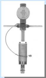
*NPT/Low Pressure Adjustable